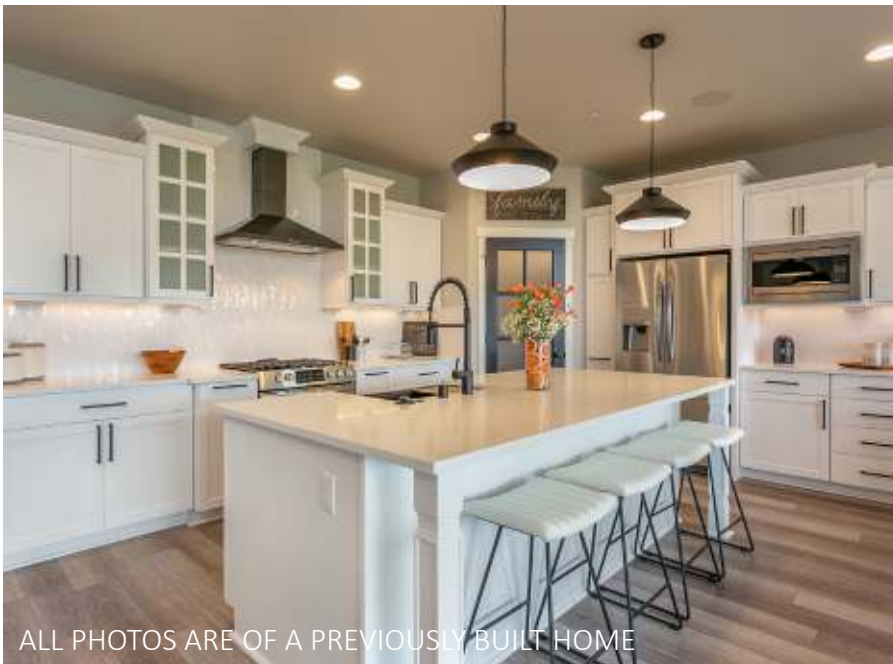
ALL PHOTOS ARE OF A PREVIOUSLY BUILT HOME